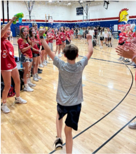
Students at 2023 Middle School Orientation